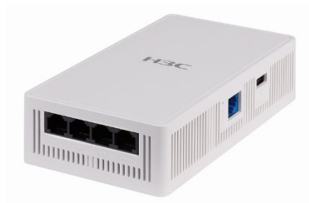
WA6120H Wi-Fi 6 (802.11ax) wireless access point

The AP features flexible installation methods, including 86×86mm panel mounting, wall mounting, and ceiling mounting.